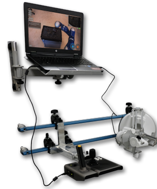
Figure 2. Setup for ANALOG-1 teleoperation experiment [23]: robot control terminal on board the ISS with laptop, joystick (bottom left) and sigma.7 device (bottom right).

When developing new control methods, the mapping between human actuation and robot motion should be carefully designed and iterated. Empirical observation shows that operators often become frustrated when they perceive their mental mapping between the joystick actuation and the robot movement as incorrect, and they need to readjust their mental models. For the proposed hap-