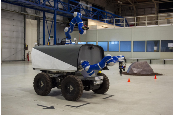
Figure 1. Setup for ANALOG-1 teleoperation experiment [23]: Mobile robot platform on ground with robot manipulators.

state of the art by systematically developing and evaluating a teleoperation interface, as well as provide valuable insights for future development of teleoperation interfaces for planetary exploration.