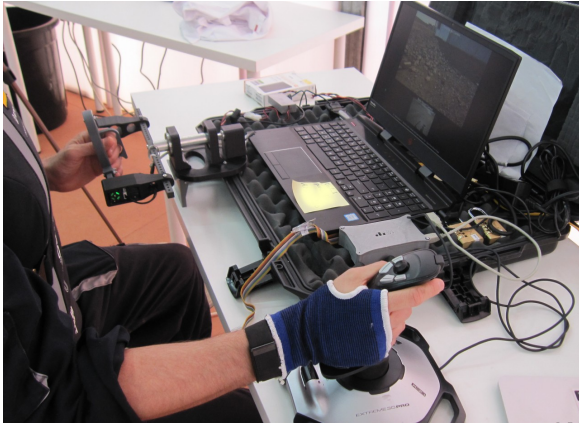
Figure 4. Setup for MEROP experiment during AMADEE-20 Mars Analog Mission [34]: analog astronaut teleoperating a ground rover outside of the habitat with a joystick (right hand), attitude device [9] (left hand), and traction glove [8] (right hand).

and sliding) of the ground robot. The operator can wear the device (glove in Fig. 4) and feel the vibration patterns on the palm of the hand when the robot loses traction. Both haptic devices were successfully integrated into a multimodal teleoperation interface as part of the MEROP experiment (see Fig. 4), during the AMADEE-20 Mars Analog Mission [34].