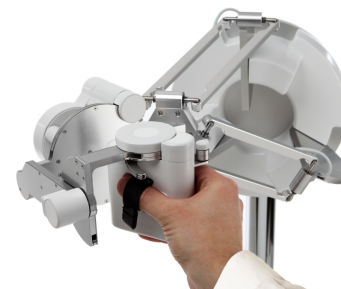
Figure 3. Operator holding the 7-DOF haptic input device sigma.7 from Force Dimension 1 .

Corujeira et al. [9] proposed a novel attitude haptic feedback device that provides information about the roll and pitch of a ground robot, through the use of upper limb proprioception. By holding this device with the hand (see Fig. 4), the operator can feel the pitch and roll of the rover on the remote environment. Luz et al. [8] presented a wearable device to generate different vibration patterns depending on the traction state (nominal, stuck